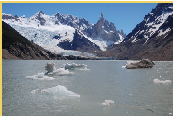
Lago and Cerro Torre.

A more relaxing but equally scenic trail took us along the Rio (river) Fitzroy up to Lago Torre, a lake peppered with icebergs which is in turn dwarfed by the formidable needle of Cerro Torre.