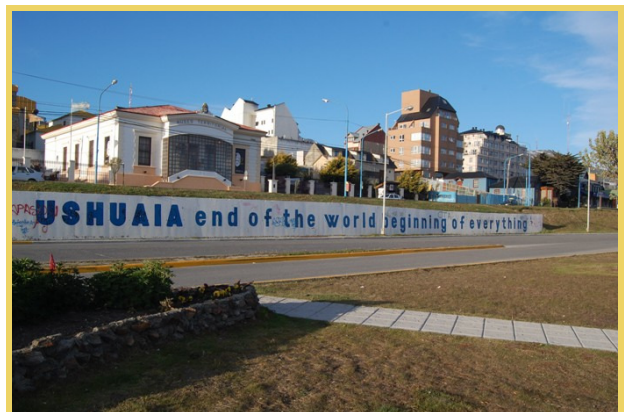
How frightening...

Ushuaia, which brazenly describes itself as the world's most southern town, is by contrast a growing urban centre catering for tourists venturing out to the Drake Passage towards the Antarctica peninsula and is also a gateway to Parque Nacional Tierra del Fuego.