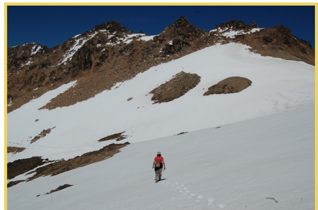
Following in the footsteps...

Descending from the snowline we reached the safety and security of a ski run which carried us back to base. In the winter time this area attracts thousands of ski enthusiasts and is the biggest resort of its kind on the continent. As we discovered on our trip Argentines much prefer going to the beaches or the barbecues rather than the nooks and crannies of the mountains.