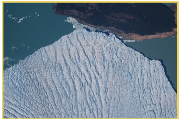
Overview of Moreno's snout.

We continued our journey southwards over the Perito Moreno glacier to the port of Ushuaia. That advancing glacier is basically a thirty kilometre giant white tongue which has its source on the shrinking Southern Patagonian ice cap.