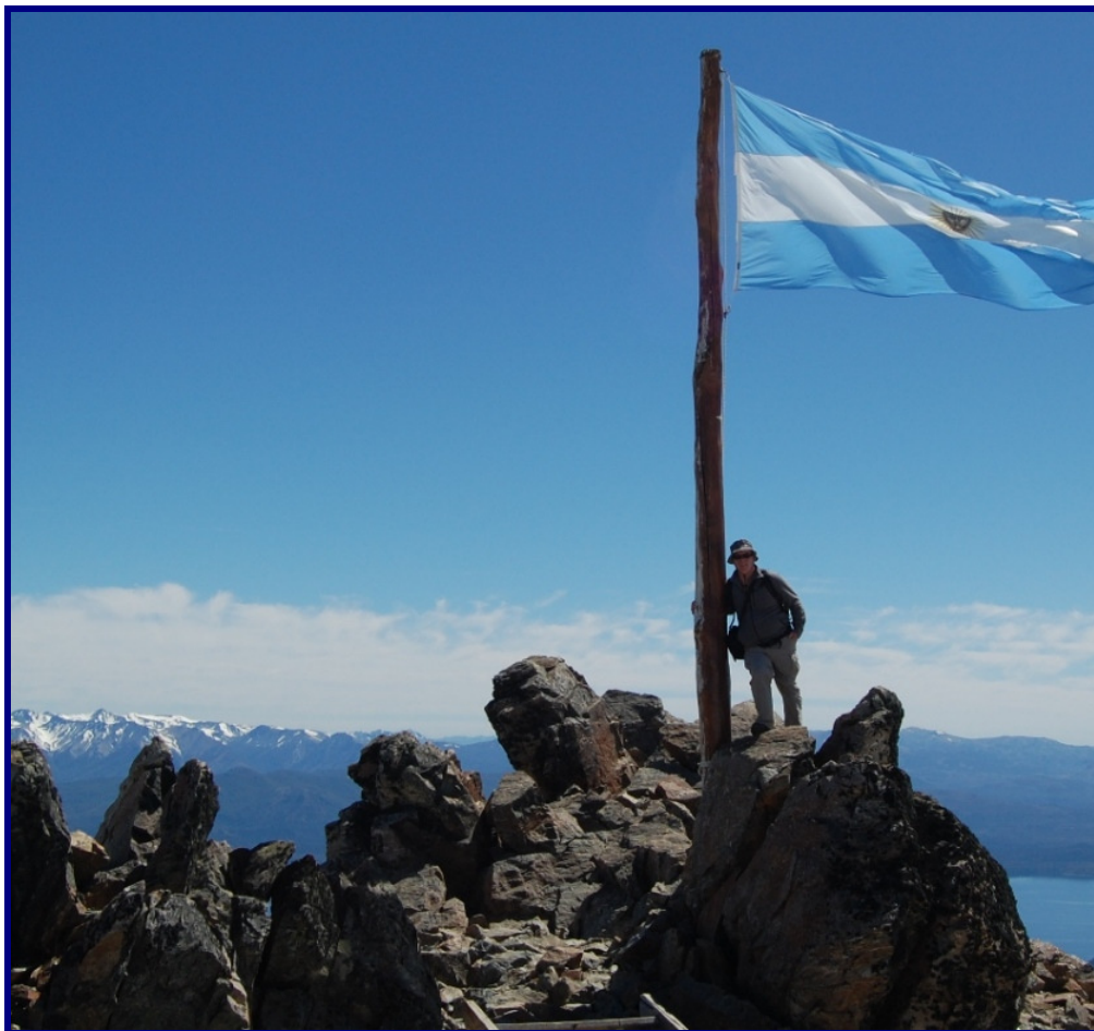
Raising the flag - Brendan Magee in South America.