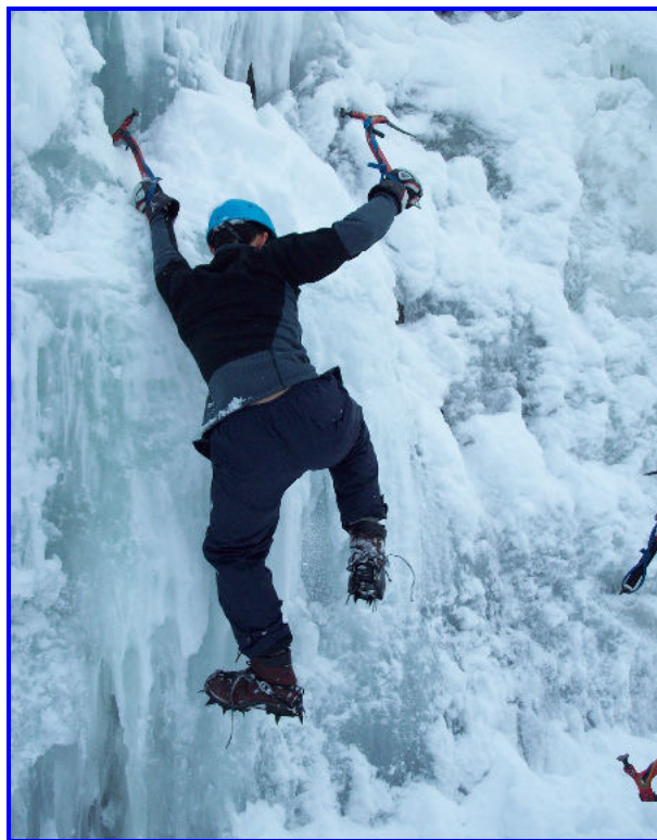
Looks invigorating and extremely tough.

On the final day we went ice-climbing in Rjukan. This is one of the best ice-climbing spots in Europe and the location of the Heroes of Telemark's amazing feat in World War 2 where they skied cross-country for miles, negotiated the ice-cliffs and managed to blow up the nearby heavy-water plant which the Nazis had intended in using to make nuclear weapons: a pivotal moment and one which I'm sure any historian will tell you I have recounted erroneously! For more details see http://knowledgegerush.com/kr/encyclopedia/Operation_Gunnerside/ .