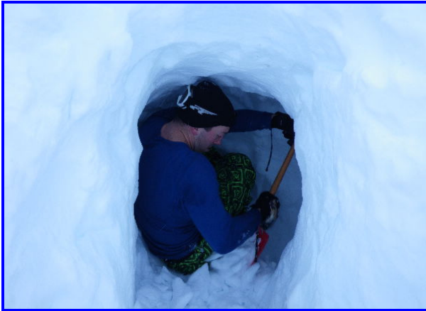
Digging a snow hole.