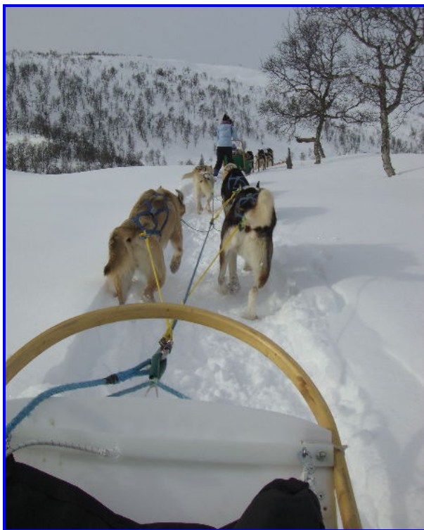
Just try and stop those huskies...

criss-crossing the countryside and by all accounts they are very popular among Norwegians who do a lot of long-distance treks in summer and winter.