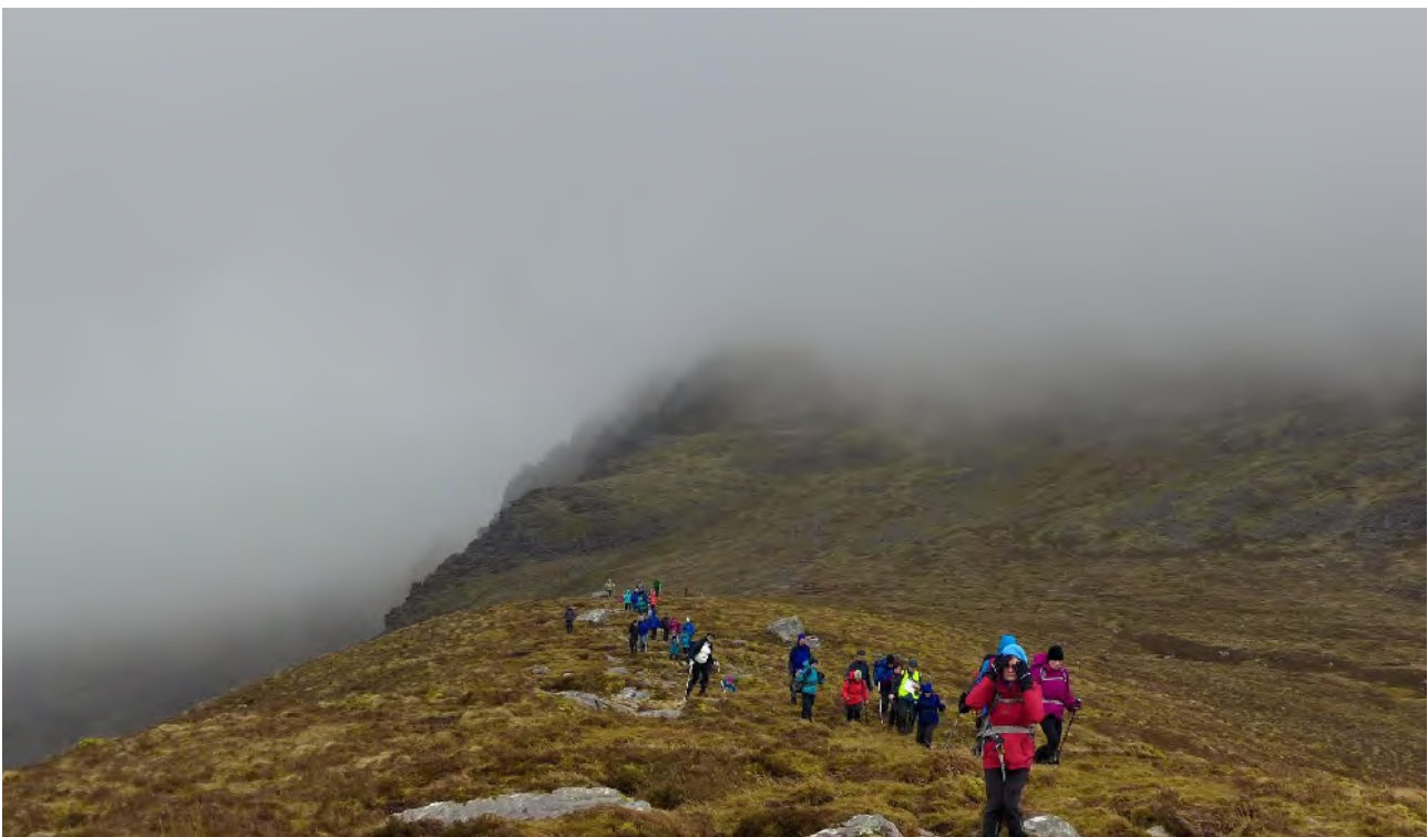
Retreat from Caher

The original objectives were to climb to the summits of Carrauntoohil and Caher however we were about to experience an enactment of Aesop's classic fable about the tortoise and the hare. The starting point was from the Breanlee Hydro road and the first group started at a pace that indicated they were determined to make and break a land speed record several times over. They were followed shortly by the second group of walkers at a steadier pace. The walkers ascended steadily passed Lough Eighter onto Lyreboy and moving towards Caher but from the very start, to echo the words of Demis Roussos, our friend the wind was coming from the west, and it was extremely strong, obstructing progress and blowing some of their feet. All the way up the second group was meeting people descending, experienced climbers and local guides, they said it was not safe and turning back was recommended. The group continued onwards and upwards until the erstwhile tortoises encountered the early morning hares waiting as the wild winds had no respect for their strength and speed. From that point the group travelled as one and quite sensibly the leaders decided to re-route. The remainder was an extremely rewarding hike with beautiful views. It followed sheep tracks and access roads towards the Lack road and Kerry Way to Lough Acoose and on to the coffee pot café beside Kate Kearney's cottage for refreshments and then through the Gap of Dunloe to our hostel.