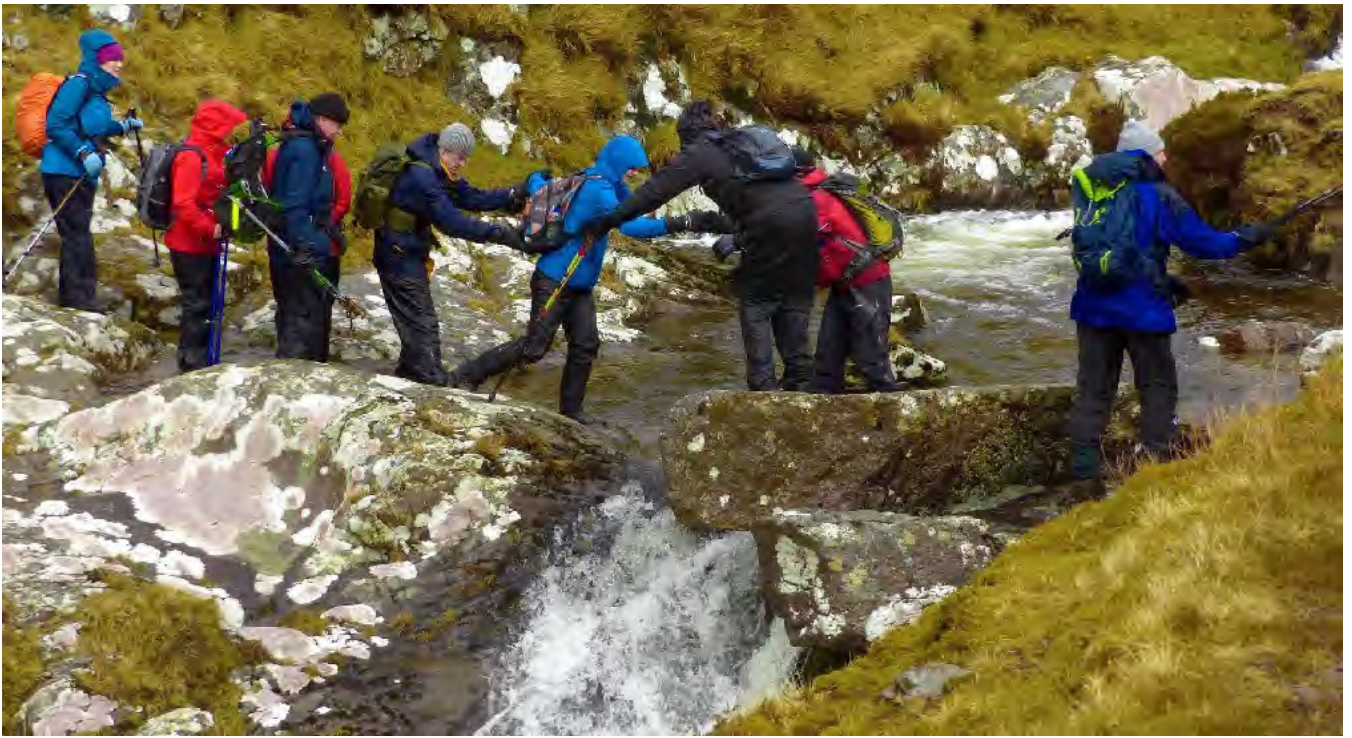
Crossing Abhainn Macha na mBó with a little manhandling