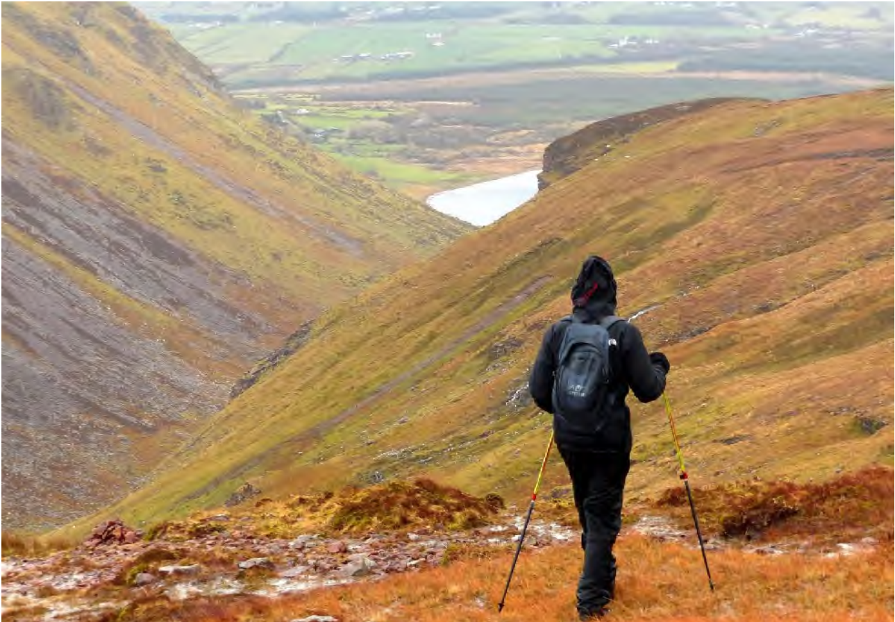
Annascaul Lake comes into view