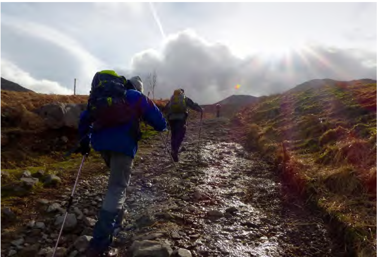
On the Hydro Road heading for Caher and Carrauntoohil

The next stop was Lidl on the outskirts of Killarney. Here, in anticipation of Good Friday, when the state becomes a theocracy for a day and is as dry as Iran on any other Friday, the foresighted stocked up on a wide variety of relaxing and socialising beverages. From here we took the Tralee road until we came to the Ring of Kerry Road and went in the direction of Killorglin until we saw the Golden Nugget Pub in the village of Fossa, turn to the left and 200 metres later we were at our destination, Aghadoe House, an 18 th century mansion set in 75 acres of gardens and forest, otherwise known as Killarney International Hostel. The original house was built in 1828 and probably redesigned in the 1860s. By 1894 it was the seat of Lord Headley and was burnt in 1922 but re-built to the same plan. This would be our home for Easter 2016 where we would be looked after by the manager John Claffey and his friendly and helpful staff. For four days they supplied us with breakfasts, packed lunches and dinners that consisted of nourishing starters followed by main courses that varied from pork chops to lasagne, fish, chicken, fresh vegetables, baby potatoes, chips and always followed by a weight watcher challenging desert. That evening the majority of the group made their way down to the Golden Nugget pub which is the social hub of the community and had a relaxing social evening over some nice pints and looked forward to the weekend ahead.