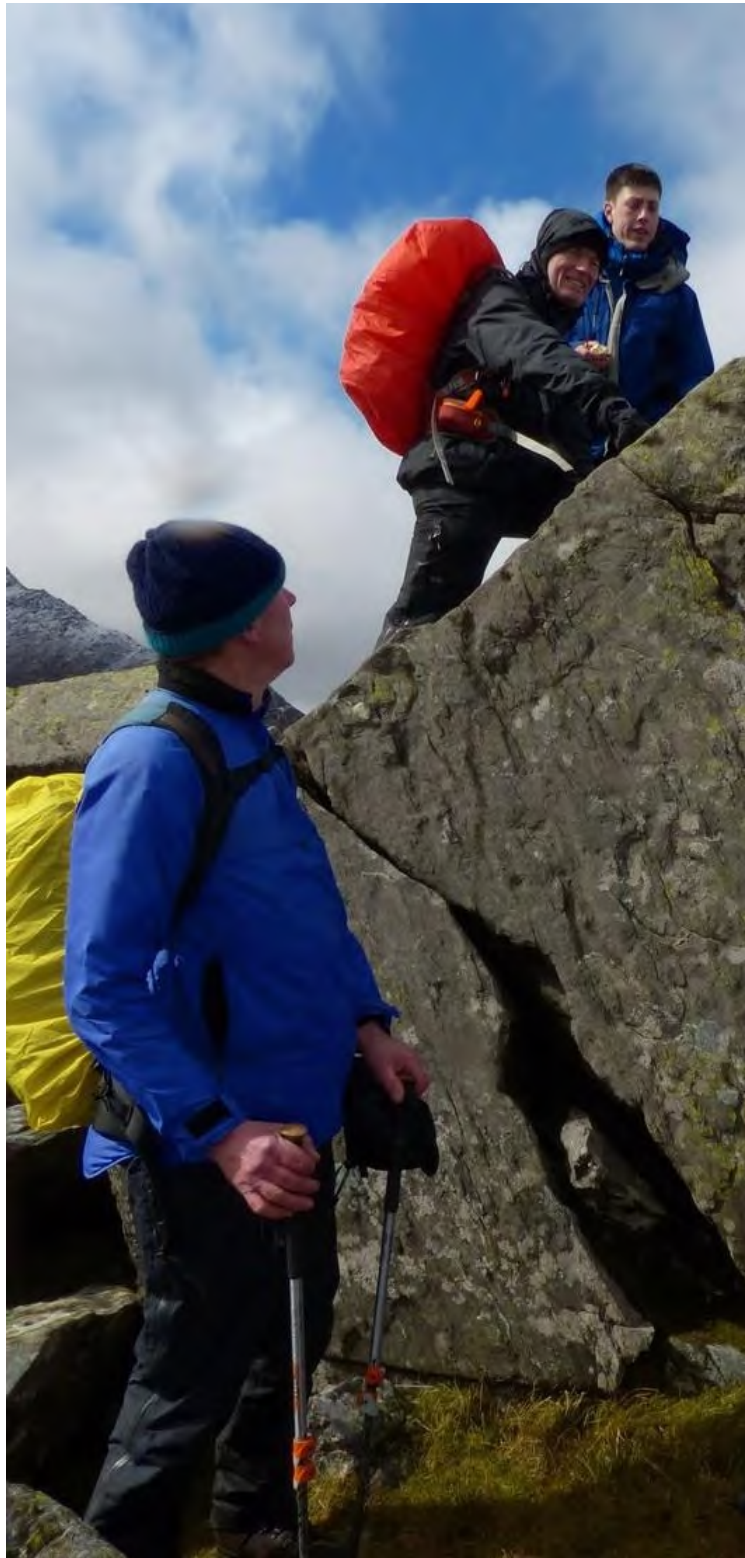
Boys will be boys

Having satisfied their appetites the Hillwalkers once again made their farewells and hit the road. At about 7.30pm on Georges Quay, Dublin the coach decanted its group of tired but happy Hillwalkers left with their fond memories of Easter in Kerry where there was barely a Healy Rae in sight.