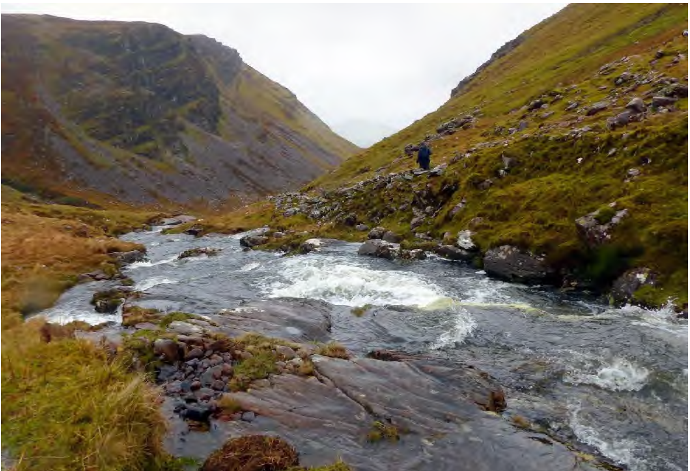
The Garrivagh River