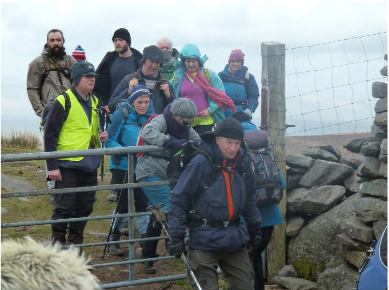
No stopping us now