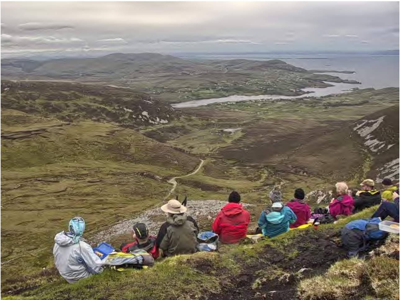
Lunch with a view

I must have been suffering from a degree of temporary insanity as I made my way up towards Kings Mountain on the way to Benbulbin. Streams of rain met us from every angle. As we reached higher ground, the rain proved too heavy and we turned back without protest. The countryside here is much more lush and fertile compared to Donegal. We got a taster of the Sligo area and look forward to a return visit soon. We had a decent lunch in the Sligo Park hotel as the rain bucketed down. We then headed for home along the N/M4.