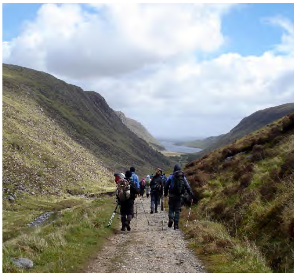
The Hills of Donegal