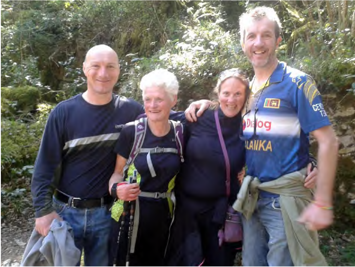
You never know who you might meet !