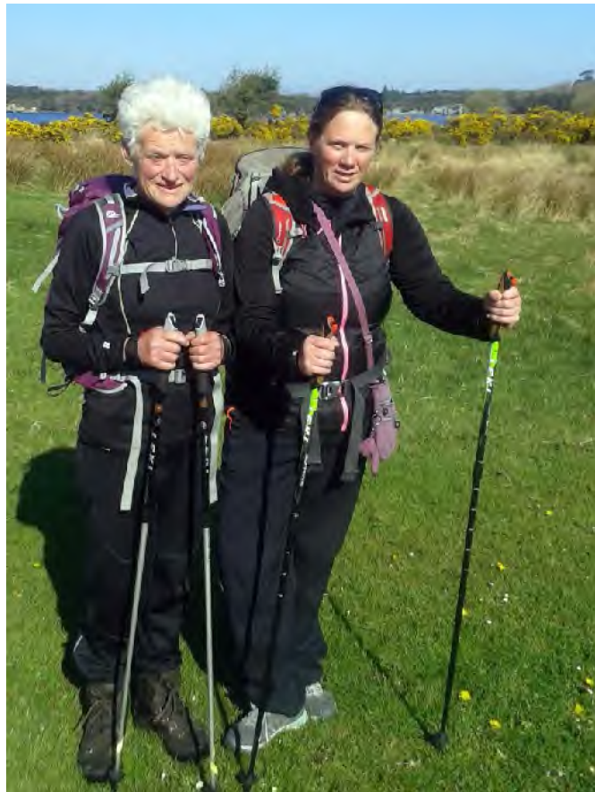
Ready for a little Nordic technique