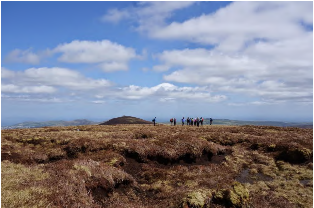
Smashing Day on the JB Malone Walk