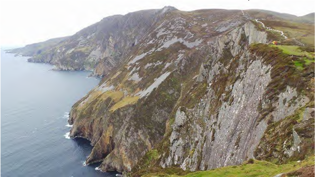
Slieve League Cliffs