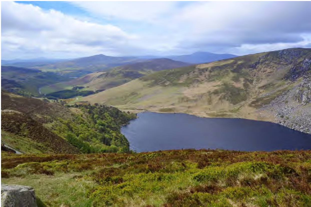
Another photo from the JB Malone Walk