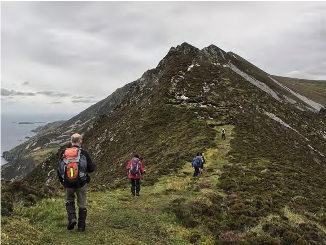
On the Slieve League Trail – photo Tess Buckley

The upland ground was wet, mucky and uneven in places so any kind of solid path would be a very welcome addition to the climbing experience. We lunched just before the summit of Slieve League (601m) and feasted on the clear views all around. I was the back marker but soon grew weary of waiting on casual strollers enjoying themselves chatting to catch up. Given that we had three leaders, I thought it would be o.k. to appoint multiple back markers and this helped alleviate some of the pressure and frustration I felt.