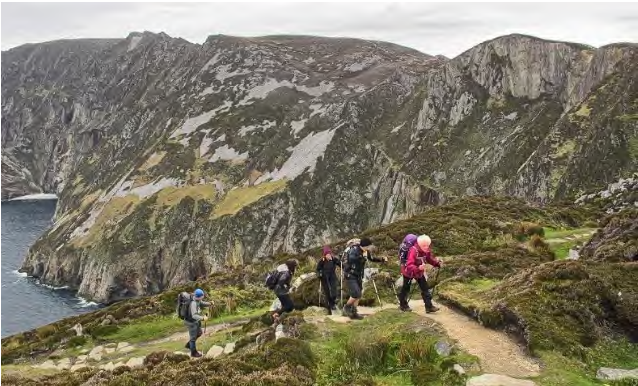
On the Slieve League Trail