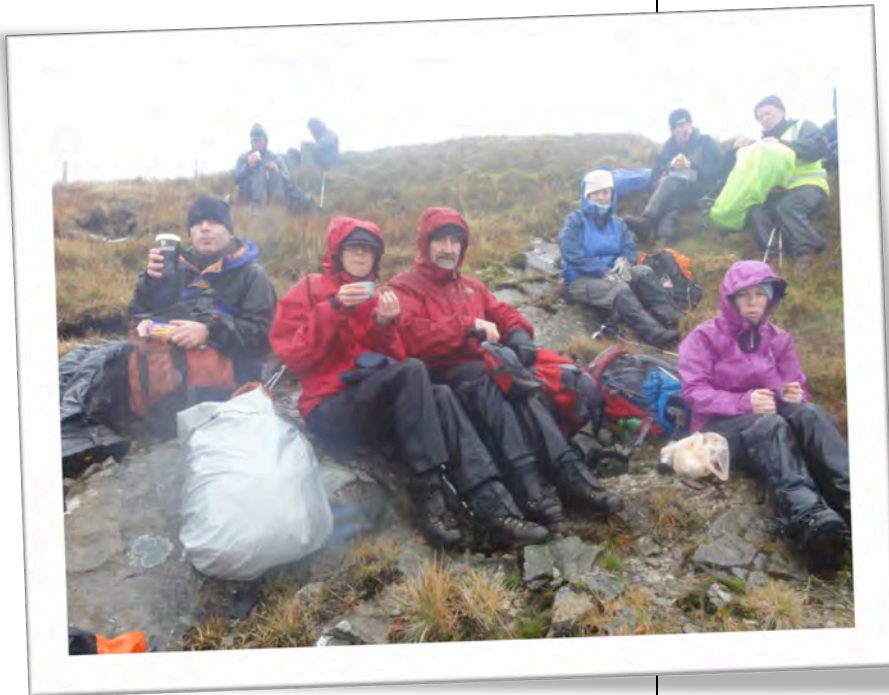
A liquid lunch. (above) Kylemore Abbey. (below, right)

or too cold. What could possibly happen to spoil such a day? Me losing my beloved iPhone. This incident held up the group as we looked for it for a while but no sign. Smaug must be using it to update his Facebook status. After about half an hour of me screaming inside my head and giving fellow hikers dirty looks for flaunting there phones in front of me I decided, very selflessly, not to let it spoil the day and get back to enjoying the stunning views. They look even better when not viewed through an iPhone!