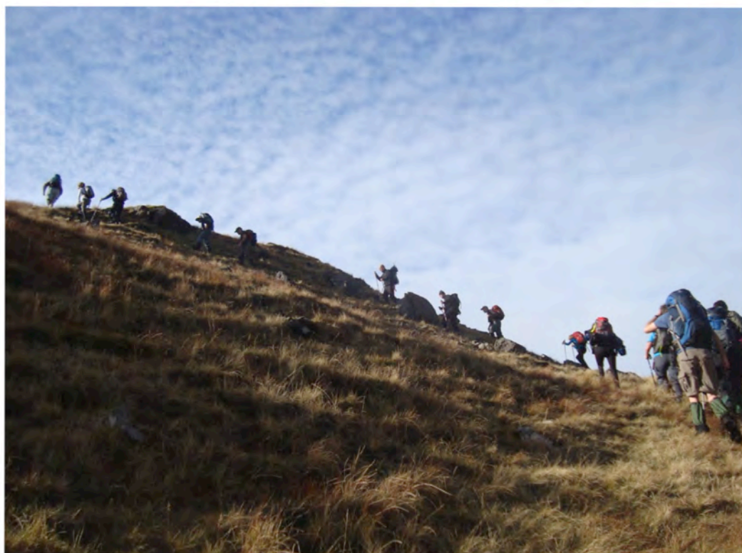
Up and up, somewhere on the Benchoona walk.