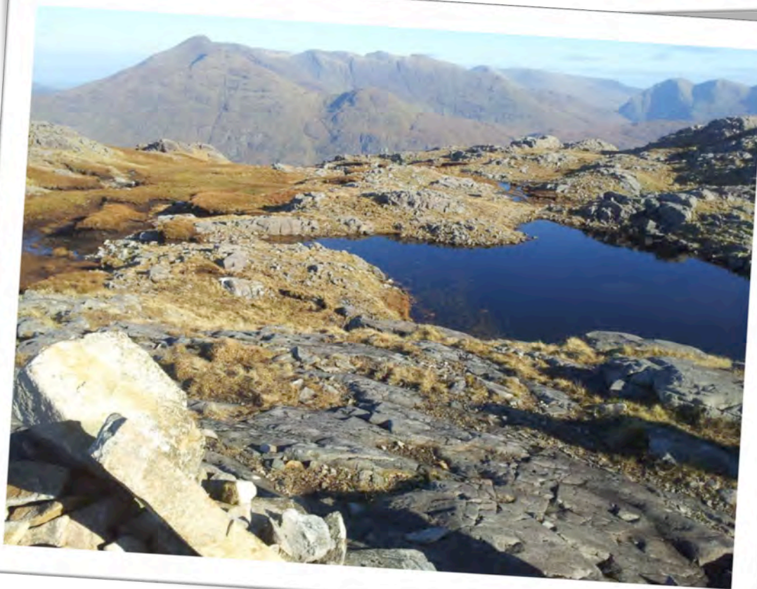
The mods on top of Tully Mountain. (top) Mweelrea mountain, Ben Creggan and Ben Gorm. (bottom)