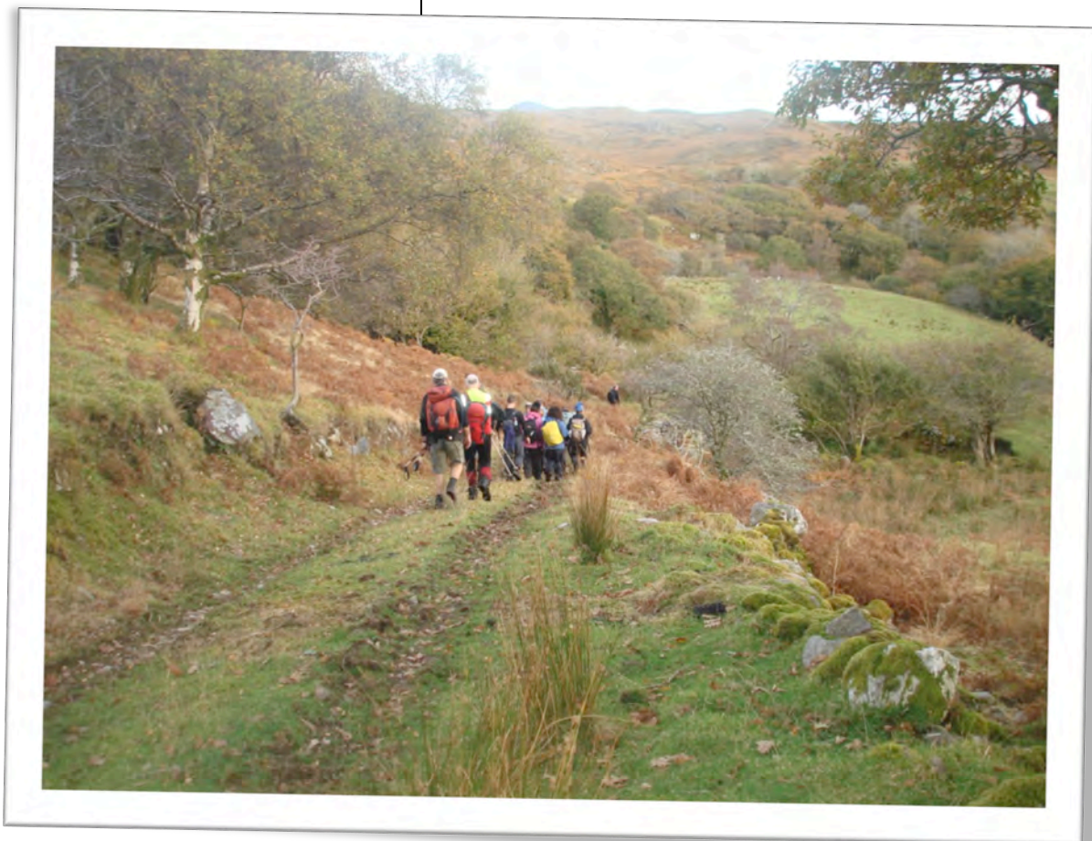
Awww, time to go home.