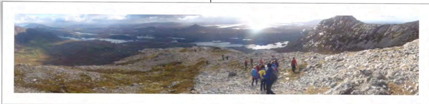
Descending to ex-An Óige hostel at Benlettery, beside Ballynahinch Lake.