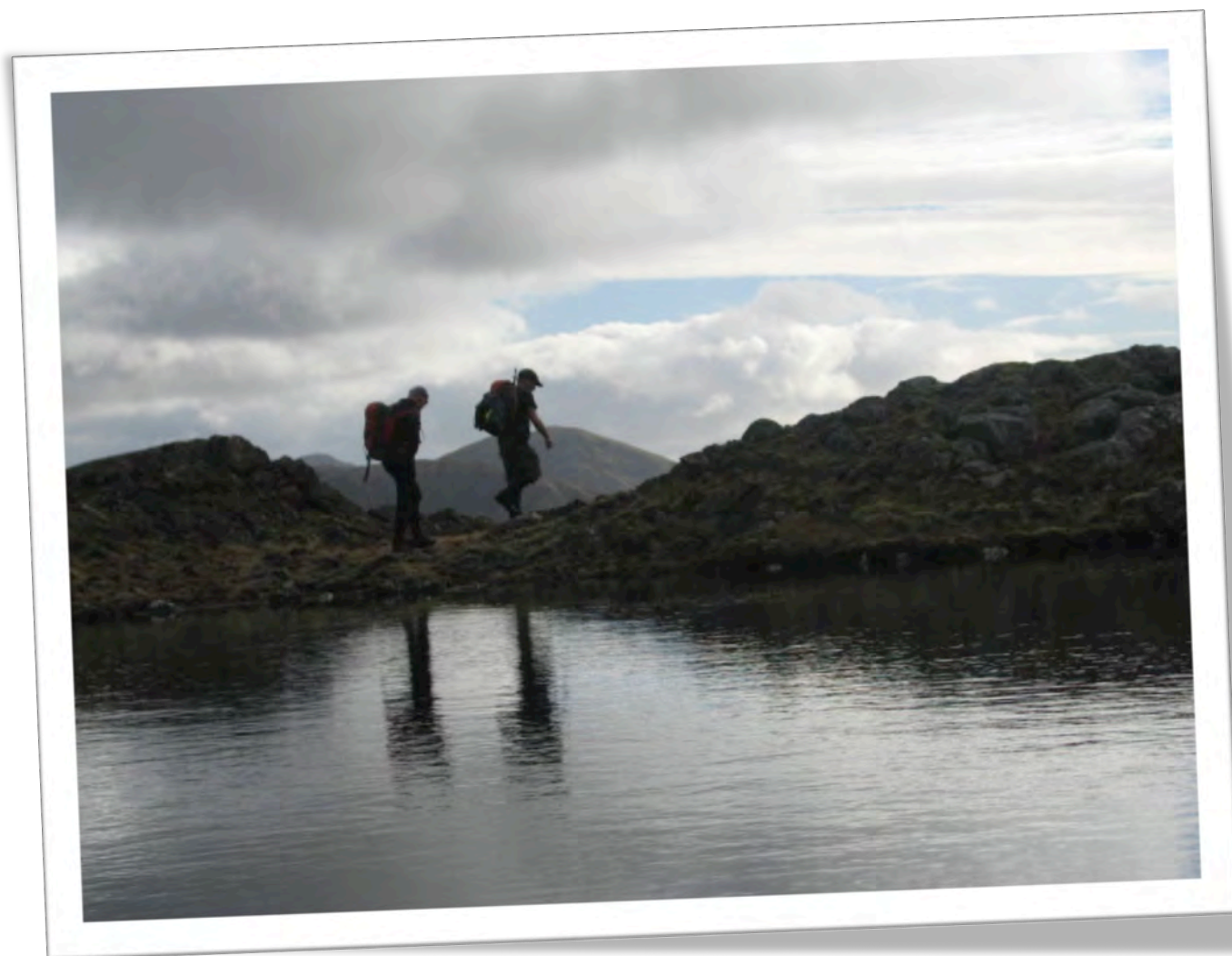
High on Doughruagh.

Later that night my navigation skills put to the test as I made my way from the bathroom into my own bed. I determined the route too risky to go alone and ended up beside Liz.