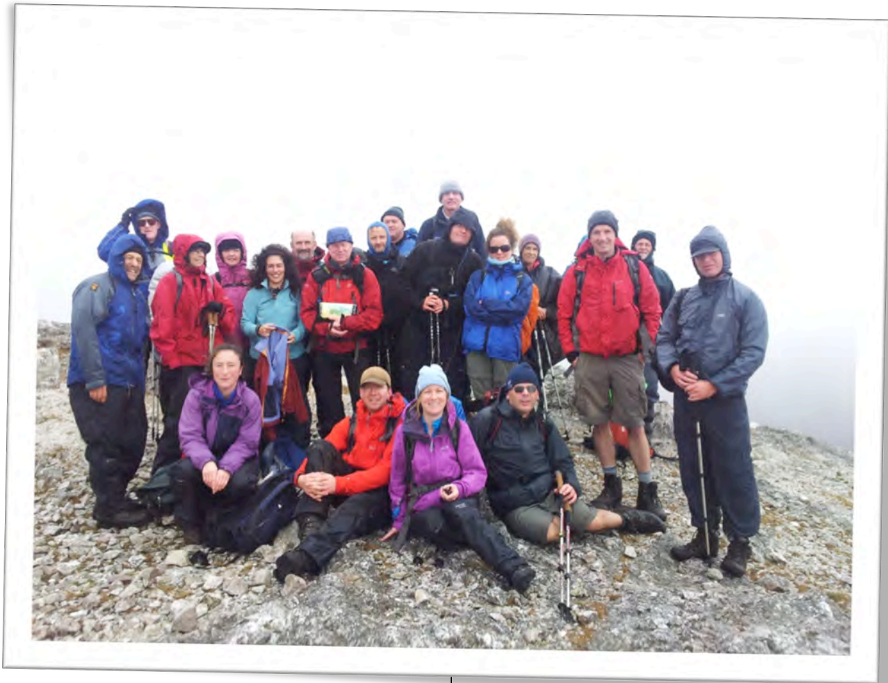
At the top of Bengower.

Next morning we were ready for off good and early. The bus collected the people at the B & B and we were then treated to a song from their hostess. I'm fairly sure that everyone on the bus that morning will always remember Clifden whenever they hear Danny Boy sung again.